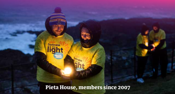
Pieta House, members since 2007