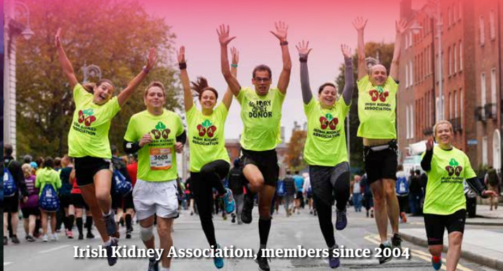
Irish Kidney Association, members since 2004