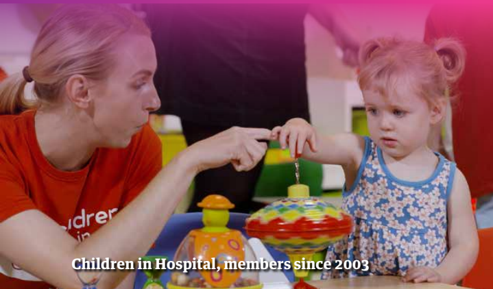
Children in Hospital, members since 2003